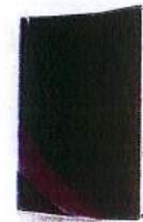
PLASTIC DUST JACKET

Plastic jackets will protect and extend the life of your yearbook.